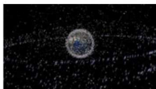
Debris on Earth Is Devastating in Orbit