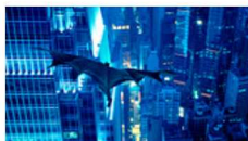
A Producer of Superheroes