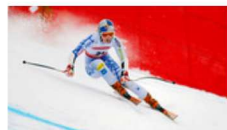
A World Champ From Buck Hill