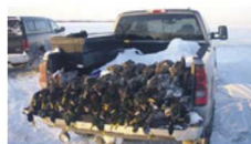
Snowmobilers' Heaven Is Hell on Wildlife