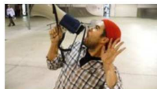
Skateboarding's Midnight Madness