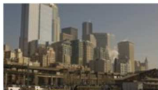
Downturn Catches Up With Seattle