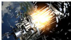
Debris Poses a Cosmic Question