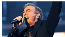
Two Roles at Concert: Singer, Scalper