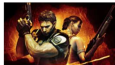
'Resident Evil 5' Reignites Race Debate